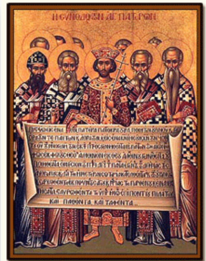
Icon depicting Emperor Constantine and the Fathers of the First Council of Nicaea